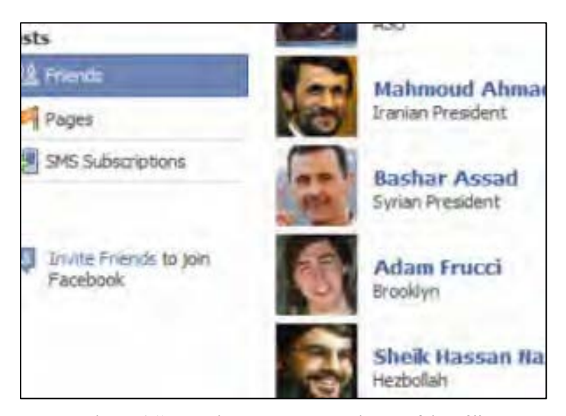
Figure 1 "You think that everyone is your friend?"

Uploading classified information to social networks or any Web site exposes the information to anyone who wishes to view it, including foreign and hostile intelligence services," the military statement read. "Hostile intelligence agents scan the Internet with an eye toward collecting information on the IDF (Israel Defense Forces), which may undermine operational success and imperil IDF forces.<sup>33</sup>