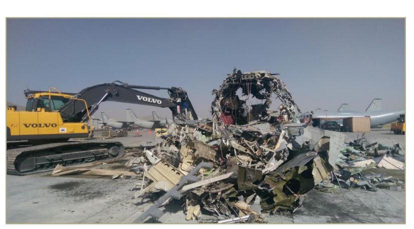
Figure 3 - G222 shredded scrap Kabul, Afghanistan August 2014

SIGAR-15-02-SP Inquiry Letter: Scrapping of G222 Fleet at Kabul Airport