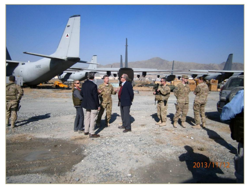
Figure 2 – Special Inspector General John Sopko inspects the abandoned G222 Fleet at Kabul International Airport in November 2013

SIGAR-15-02-SP Inquiry Letter: Scrapping of G222 Fleet at Kabul Airport