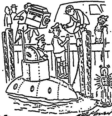
"... And now we're submerging to search the harbor bottom, and we fully expect to find the sunken treasure."