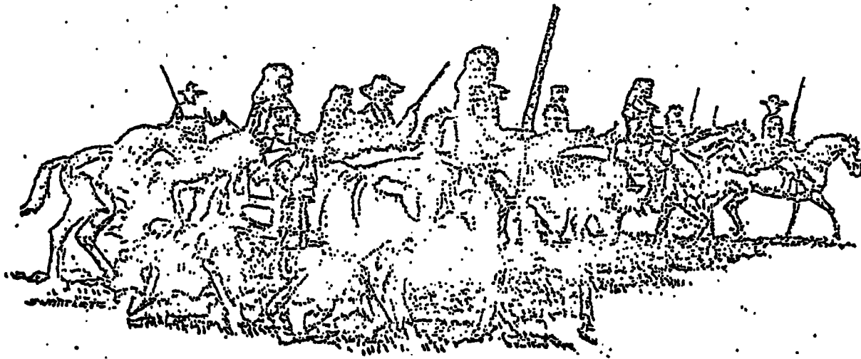
What became of Thomas Jefferson Beale and his band of hardy mountain men, no one knows. But his treasure codes have lingered on to baffle and confuse treasure hunters for the past 150 years.