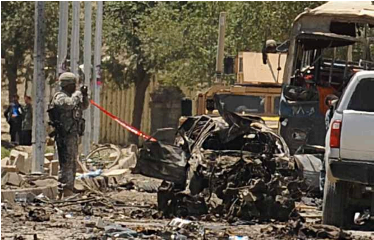
Kabul, Afghanistan: Afghan and foreign investigators inspect the site of a suicide attack in Kabul on May 18, 2010. The Taliban, the militia leading a nearly-nine year insurgency against the western-back government and U.S.-led foreign troops, claimed responsibility for the attack, saying they had targeted NATO forces.

Afghanistan continued to process travelers on entry and departure at Kabul international airport with the Personal Identification Secure Comparison and Evaluation System (PISCES). Afghan authorities reviewed plans for expanded PISCES installations at additional locations.