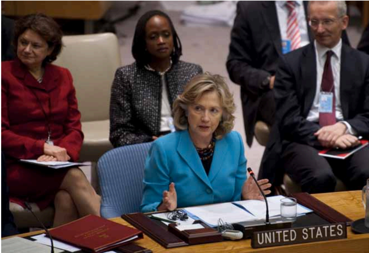
New York City: U.S. Secretary of State Hillary Clinton speaks during a UN Security Council meeting on terrorism September 27, 2010.

Not all of AQ's formal affiliates and informal allies presented as grave a threat to U.S. interests in 2010. No group has made a bigger name for itself in the kidnapping for ransom business than al-Qa'ida in the Islamic Maghreb (AQIM), which relies on ransom payments to sustain and develop itself in the harsh Saharan environment. AQIM carried out several attacks and continued kidnapping foreigners for ransom but is not an existential threat to governments in the region. The U.S. government urged its allies to refuse to pay AQIM and other terrorist group's ransoms, which have become a primary means of financial support for terrorist organizations.