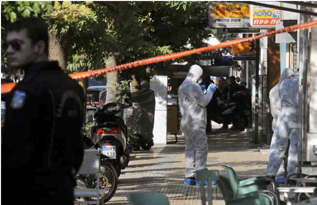
Athens, Greece: Police investigators search for evidence at the site of a bombing near a courier company's offices on November 1, 2010 in the Athens suburb of Pangrati. Four people were arrested.

Countering Terrorist Finance: On September 30, with U.S. government technical assistance, Kosovo adopted a comprehensive anti-money laundering law, the Law on the Prevention of Money Laundering and Terrorist Financing (LPMLTF). The law imposed international and Financial Action Task Force-compliant reporting obligations, including reporting suspicious and structured transactions. The LPMLTF also established an independent Financial Intelligence Unit, which must report any transaction above 10,000 Euros, suspicious transactions, and structured transactions.