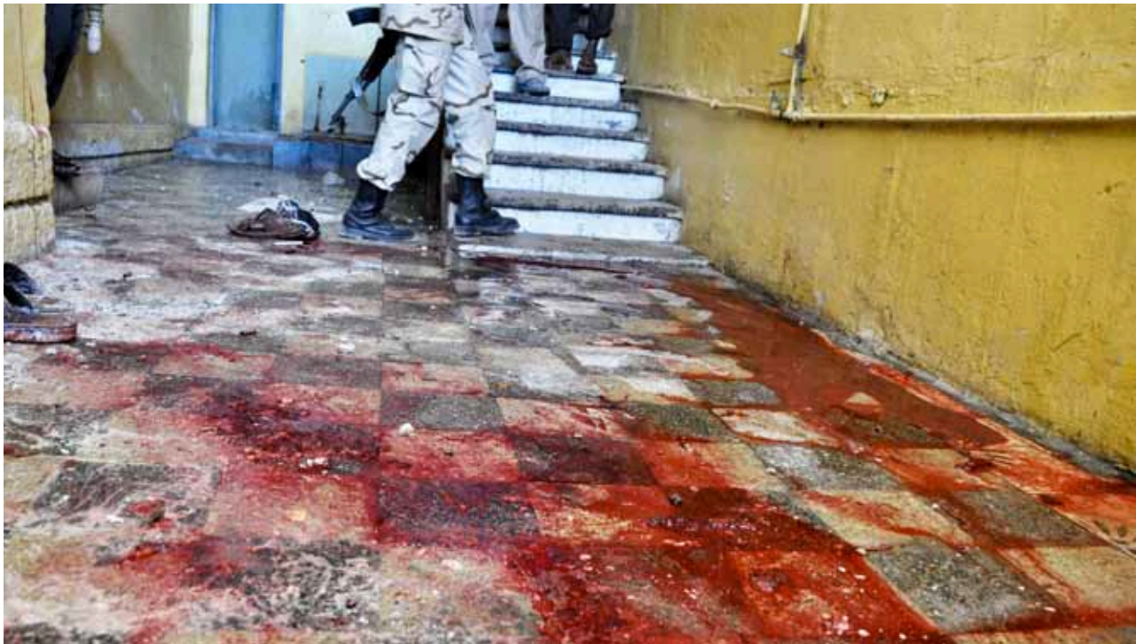
Mogadishu, Somalia: Stains of blood cover a hallway inside the Hotel Mona in Mogadishu on August 24, 2010. Two extremist insurgents disguised as government soldiers went on a shooting rampage in the Mogadishu hotel, killing 30 people, before blowing themselves up. The brazen attack by al-Shabaab near the presidential palace marked a new escalation on the second day of clashes that had already left 29 civilians dead across the war-ravaged Somali capital.