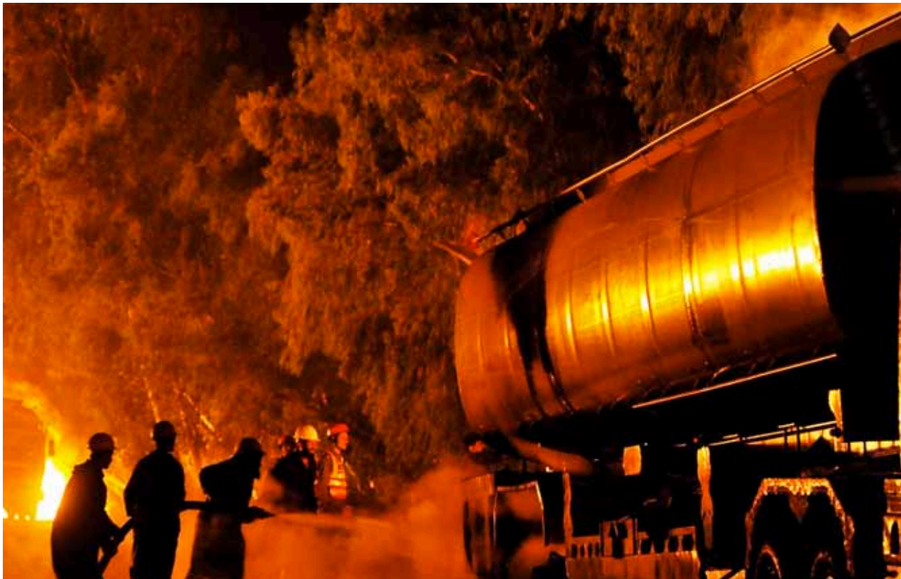
Nowshera, Pakistan: Pakistani firefighters try to extinguish burning NATO oil tankers following a Taliban attack in Nowshera on October 7, 2010. More than 40 NATO vehicles were destroyed in two separate Taliban attacks in Pakistan on October 6 as the militants stepped up their efforts to disrupt supply routes into Afghanistan.

Tajikistan's counterterrorism policies were focused mainly on controlling Islam in society and increasing the capacity of Tajikistan's military and law enforcement community to conduct tactical operations. The latter was undertaken with support from bilateral assistance programs with the international community. While the government maintained a list of banned groups it considers "extremist," the list included several religious groups – including Jehovah's Witnesses; Tablighi Jamaat, an Islamic missionary organization; and the Salafiya sect – that the government banned despite a lack of any evidence that members engaged in violent extremist activities.