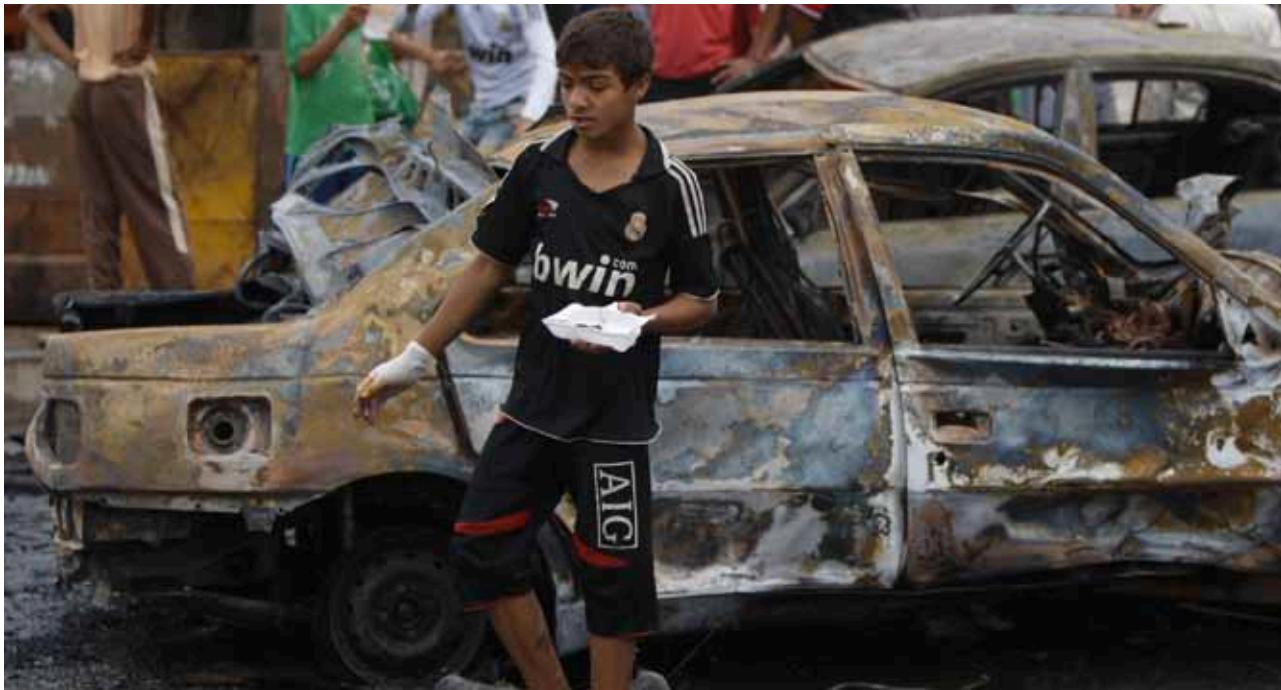
Baghdad, Iraq: Iraqis gather at the scene of a car bomb that exploded on April 23, 2010 in the Baghdad district of Sadr City. A series of five car bombs, three during prayers at Shiite mosques in Baghdad, and other attacks across Iraq, killed 58 people.

or reinforce more balanced views, based upon established Islamic jurisprudence and teachings. Jordan segregated extremist prisoners in order to deny them the opportunity to spread their violent ideology among the general inmate population.