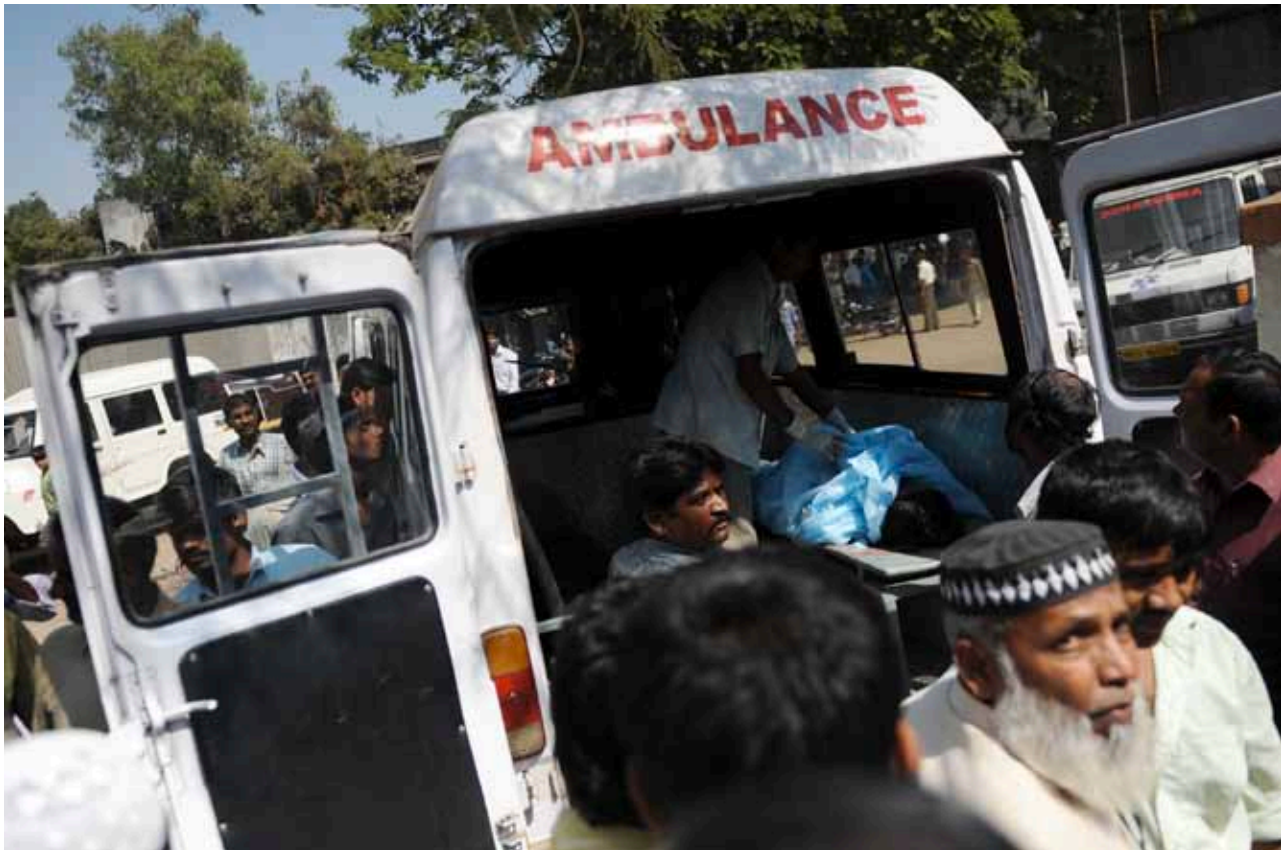
Puné, India: The dead body of a blast victim lies inside an ambulance outside a hospital in Puné on February 14, 2010. A bomb ripped through the German Bakery restaurant, a destination popular with tourists, late on February 13, killing nine people.

completed its plan for the construction of a Material Protection, Control, and Accountability (MPC&A) training center, to be built with support from the U.S. Department of Energy at the Institute of Nuclear Physics near Almaty. In October, Kazakhstan reiterated its intent to establish an additional “Center to Combat the Illegal Use of Nuclear Materials” in Kurchatov to train Kazakhstani rapid response units to combat nuclear terrorism.