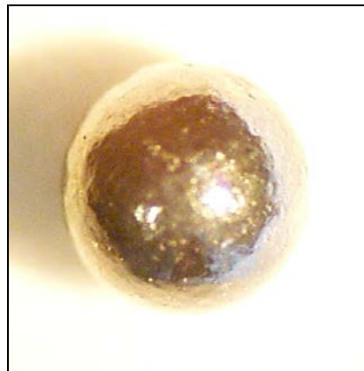
7 ½ Lead Shot, New