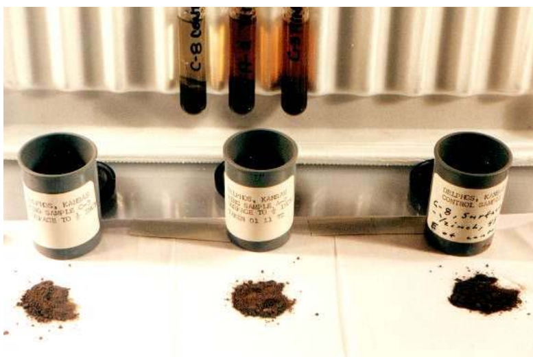
Photograph of the two ring soils (C-3, left; A-2, center) and the control soil (C-8, right).

Ring soil samples have been reported to be much lighter in color than the control soils 7 . Subtle color differences are noted for the samples analyzed in this report. Following is a photograph of two ring soils and one control soil in front of their original containers.