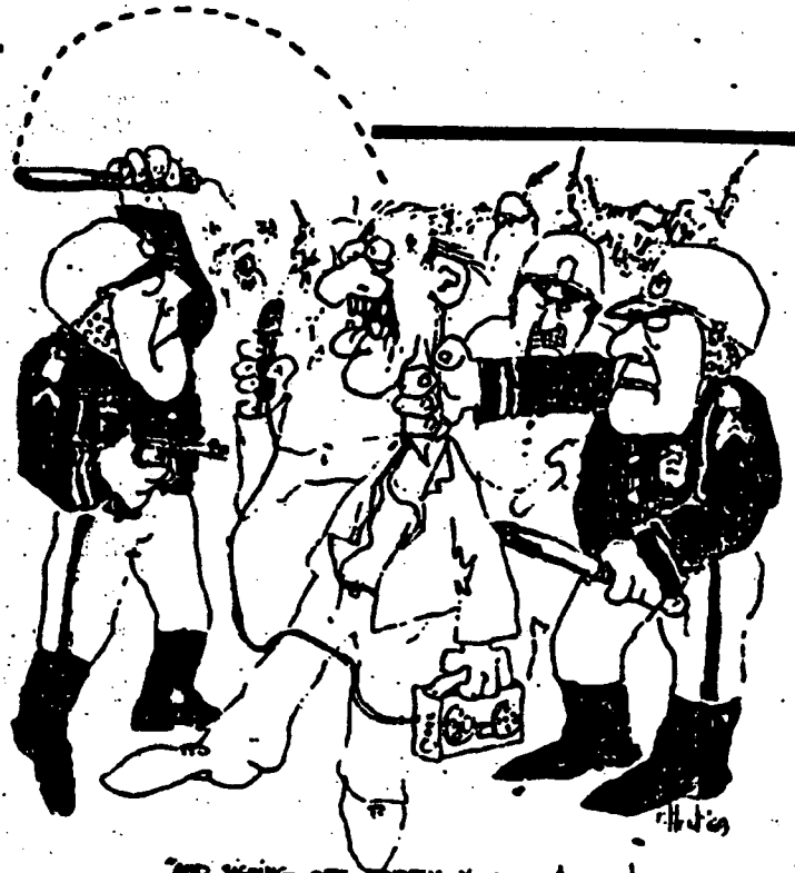
AND SINGING CITY BERTLY, THAT ON THE SPOT REPORTER, AN OUPLE REFORMATION