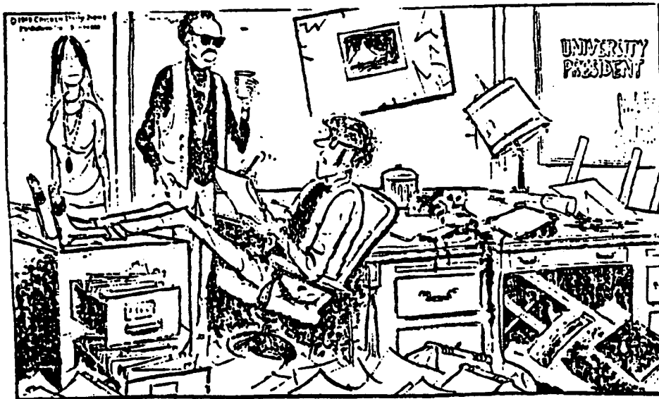
"How do you spell amnesty? Man, I'm lost when I get past four letters."