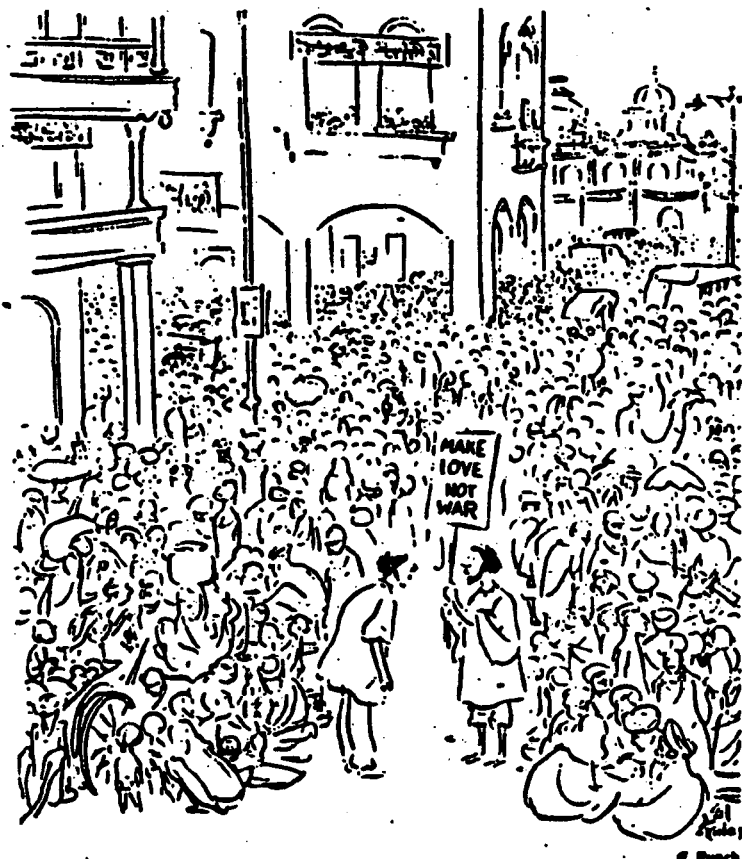
"Are you kidding?"