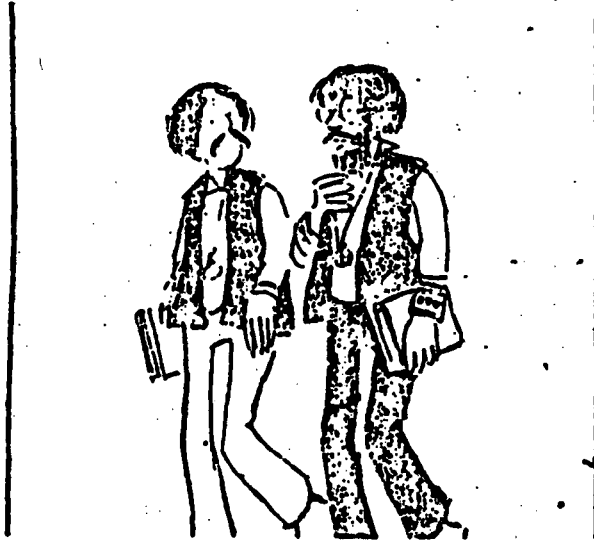
"It's my greatest identity crisis. I went home to get the tuition for next semester, and my parents didn't know me."