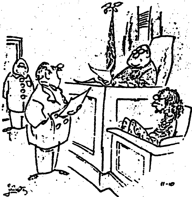
"In defense of my client, I might say that the burning of a college administration building is considered as American as apple pie these days!"