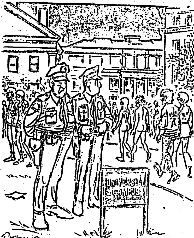
INTERLAND © 1962, LES AIGLES TIMES