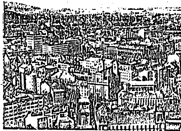
LJUBLJANA - FROM THE CASTLE

The University of Ljubljana was founded shortly after World War I. Today, when nearly all faculties and departments are complete, there are more than 10000 students studying here. The students have their own organization with many cultural and sports groups, and also their own newspapers.