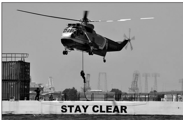
Figure 13. LASD SWAT team member executing a fast rope insertion onto a ship in a counterterrorism exercise.

Whether all areas of the country will have adequate response capability remains to be seen. Mentioned was the expense associated with developing and maintaining specialized units. National-level funding to accomplish that task could be provided, even though we are in a zero-sum environment when it comes to spending. While regional cooperation is improving, much more could be done. For local jurisdictions, having specialized units on a full-time basis is resource constrained based on the current tax situation. For departments in large metropolitan areas, maintaining SWAT teams is