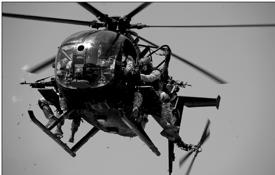
Figure 12. SOF engaged in counterterrorism operation approaching the target.

Threats posed by international terrorists are of major concern to national LEAs that function primarily under the jurisdiction of the Department of Justice. Recognizing that they constitute only about 5 percent of the law enforcement personnel in the U.S., they are now engaging with state and local officials as never before. Area fusion centers have sprung up across the country, and information sharing is improving—but has a long way to go. As noted in The 9/11 Commission Report , interagency cooperation was severely lacking prior to that attack. Constant attention and improvement is