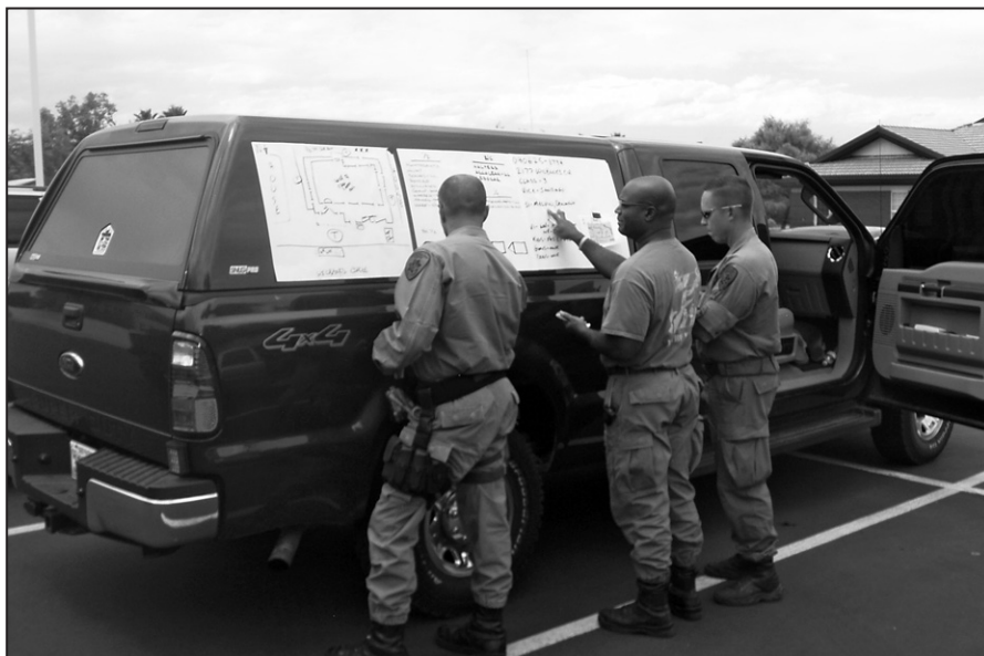
Figure 8. Las Vegas SWAT team prepares to execute a high-risk warrant. Every team member is briefed on assignments and confirms equipment to be carried.

The planning process is repeated in great detail, even when the unit is executing several warrants in a single day. Like with military missions, while operations may be similar, no two are identical. 143