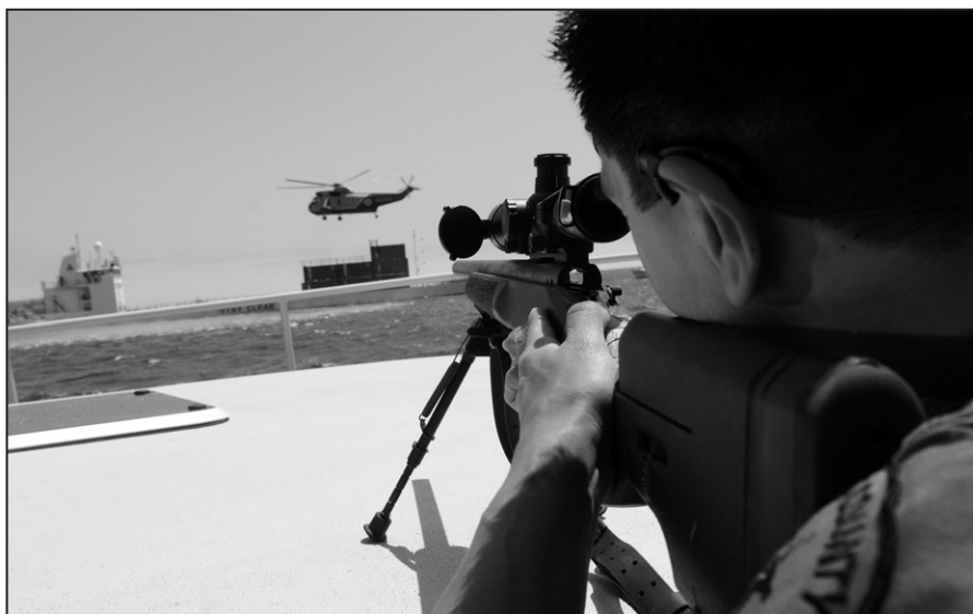
Figure 10. LASD sniper engaged in counterterrorism training exercise involving protection of shipping.

In many situations the sniper is employed to save lives. While that might sound counterintuitive, in both SOF and law enforcement, the sniper is often used to protect others. SWAT units resort to use of deadly force as a last resort. Unfortunately, movies and television have contributed quite negatively and produce an image of trigger-happy marksmen. The reality is far different; it is only in rare instances that SWAT snipers actually