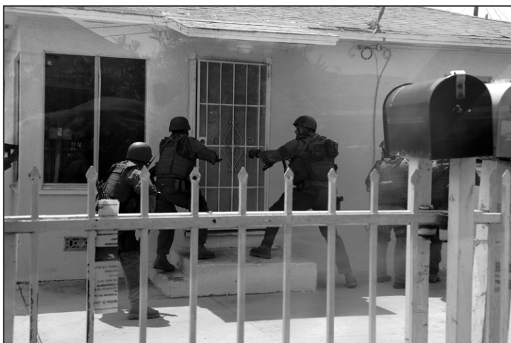
Figure 4. LASD SWAT practicing dynamic entry for service of high-risk warrants.