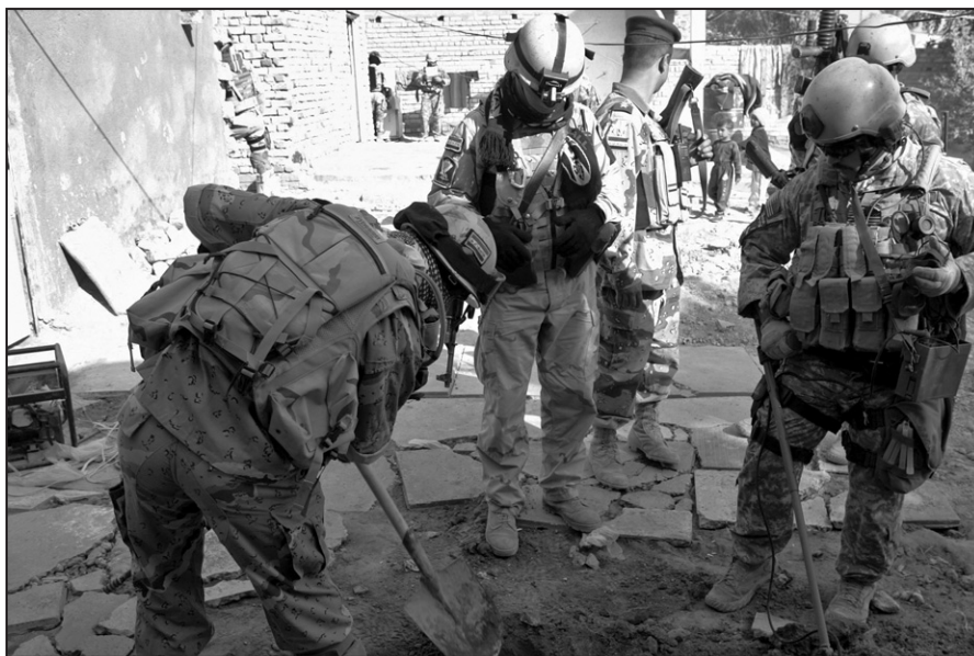
Figure 5. SOF with Iraqi counterparts search for evidence following explosion of an IED.

Television programs portray specialized forensic units indigenous to major LEAs that engage exclusively in collecting evidence and scientific sleuthing. Reality is a bit different. At all stages in their career, starting from the academy, officers learn how to isolate and protect evidence at a crime scene. Crime scene specialists then follow up, often under relatively controlled circumstances. Collection of evidence on the battlefield usually is more difficult. While specialists are available on some occasions, most often it will be SOF personnel engaged in the collection. For instance, teams have been sent in to attempt to confirm the identities of high-value targets who have been attacked and killed by bombs or rockets.