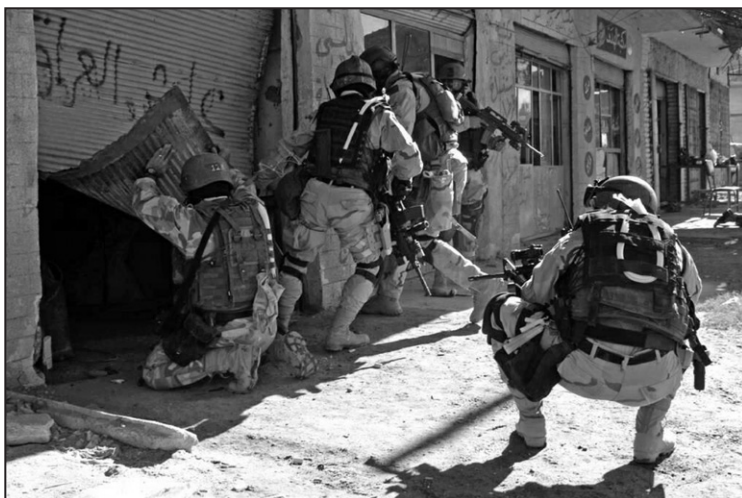
Figure 3. SOF conducts dynamic entry in search of high-value target in Iraq.

apparent, but in ways unanticipated. It was the SOF involvement in the legal aspects of mission execution followed by criminal prosecution that was totally unexpected. In most incidents, they were serving as advisors to Iraqi officials who were technically in command of the operations. Still, the SOF personnel found themselves integrally involved in the Iraqi legal system.