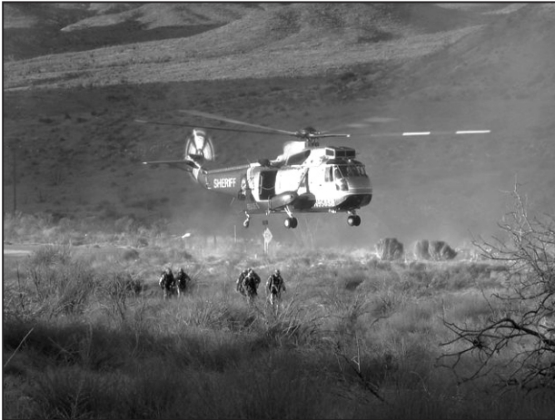
Figure 1. Los Angeles Sheriff's Department SWAT team members training for small-unit tactics in the Mojave Desert.

Local and international gangs have precipitated a level of violence in some precincts that is unparalleled in our nation's history, even dating to the notorious crime syndicates of the early 20th century. The response by many LEAs has been to organize and train specialized units, commonly called SWAT teams, which often have capabilities to perform operations that bear striking resemblance to small unit military operations.