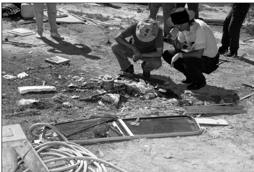
Figure 6. Crime scene investigators search for evidence in a bombing that killed a federal witness in Las Vegas.

When IEDs are encountered, even after boom , minute details remain and individuals have been identified from the scraps of evidence collected. Thousands of latent fingerprints have been taken off of bomb components such as circuit boards, batteries, and remote control devices. 85 Much of the forensic investigation is conducted by FBI scientists with whom many USSOCOM units have been collaborating for the past few years. 86 What seems certain is that SOF personnel will continue to be involved in obtaining and protecting vital evidence. Defensive issues are also to be addressed so that forensic science does not threaten the identity of SOF operators. Both sides of this coin lead to the conclusion that more intensive training is dictated.