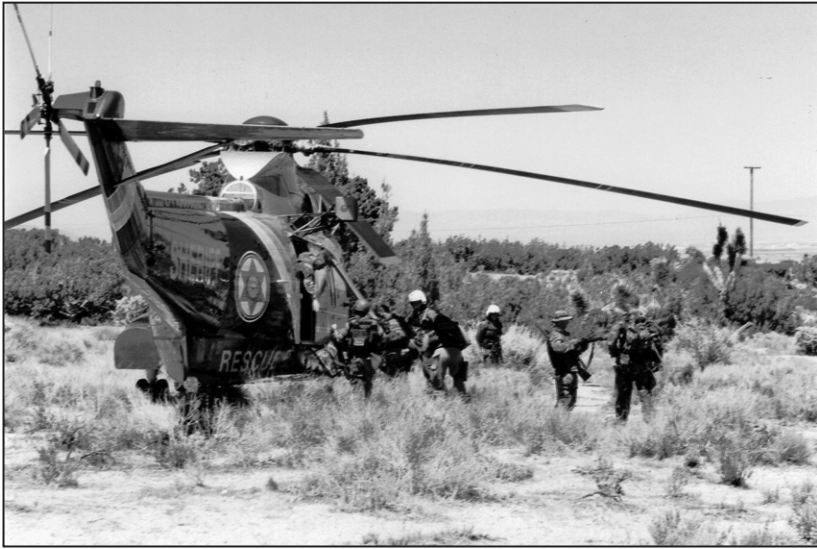
Figure 2. LASD SWAT team responds quickly to active shooter.

it is important to engage the shooter as rapidly as possible. As on combat missions, it may be necessary to bypass wounded victims in order to minimize casualties of innocent bystanders. This consideration represents a substantial change in thinking for law enforcement and is an example of the convergence of the operations. Because of the LEA experiences with multiple shooters and substantial numbers of casualties, the need for area security now preempts immediate care for victims.