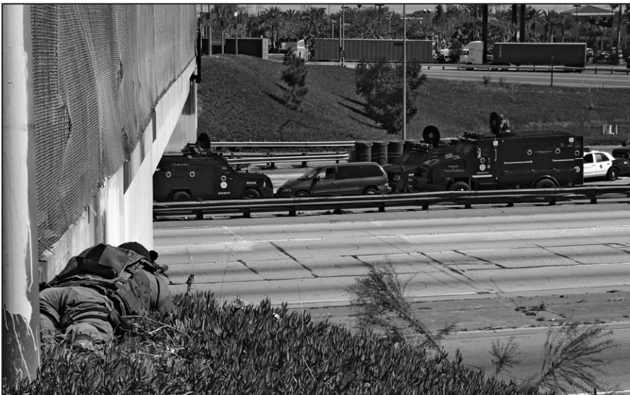
Figure 7. SWAT sniper in overwatch as team members take down a suspect in a vehicle on a Los Angeles freeway.

Given their career in an LEA, they get to know individuals and develop networks that can support their activities. Most major metropolitan areas employ the program known as COPS. Those Community-Oriented Policing programs assure that officers are assigned to a specific small geographic area. It is designed to have officers know the community leaders and businessmen. Ideally, they actively participate in local activities, work to gain the trust of the population, and listen to their problems and concerns. 131 It was found that fixing small problems and grievances greatly reduced larger ones. Again, the LEAs have the home court advantage.