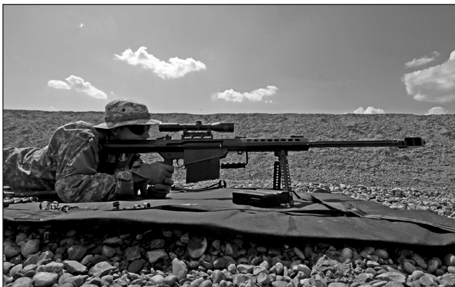
Figure 9. SOF sniper training in desert environment.

One aid in dealing with cross-jurisdictional manhunts is that sheriff's deputies also can be sworn as U.S. Marshals. This capability may allow the suspect to be arrested by officials from the original jurisdiction of the crime and expedite extradition. International cases are considerably more difficult. Even if the suspect's whereabouts is known, the time and expense required for international extradition makes such processes reserved for only the most egregious crimes. 153