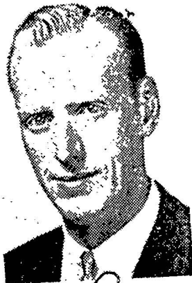
Charles H. Keating Jr.

"I shall serve on the commission with the objective of seeing these criminals jailed. The decent people of this country want to strike back at the filth peddlers. I propose to be an articulate, active representative for these citizens."