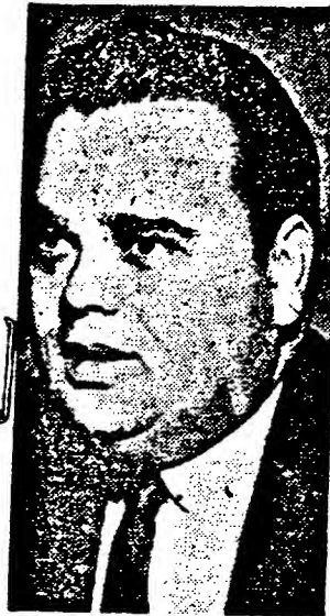
DR. BILLY J. HARGIS

He asserted that "only liberalism breeds Communism" and pointed to the fundamental teachings of the Catholic church and its strong opposition to Communism as proof