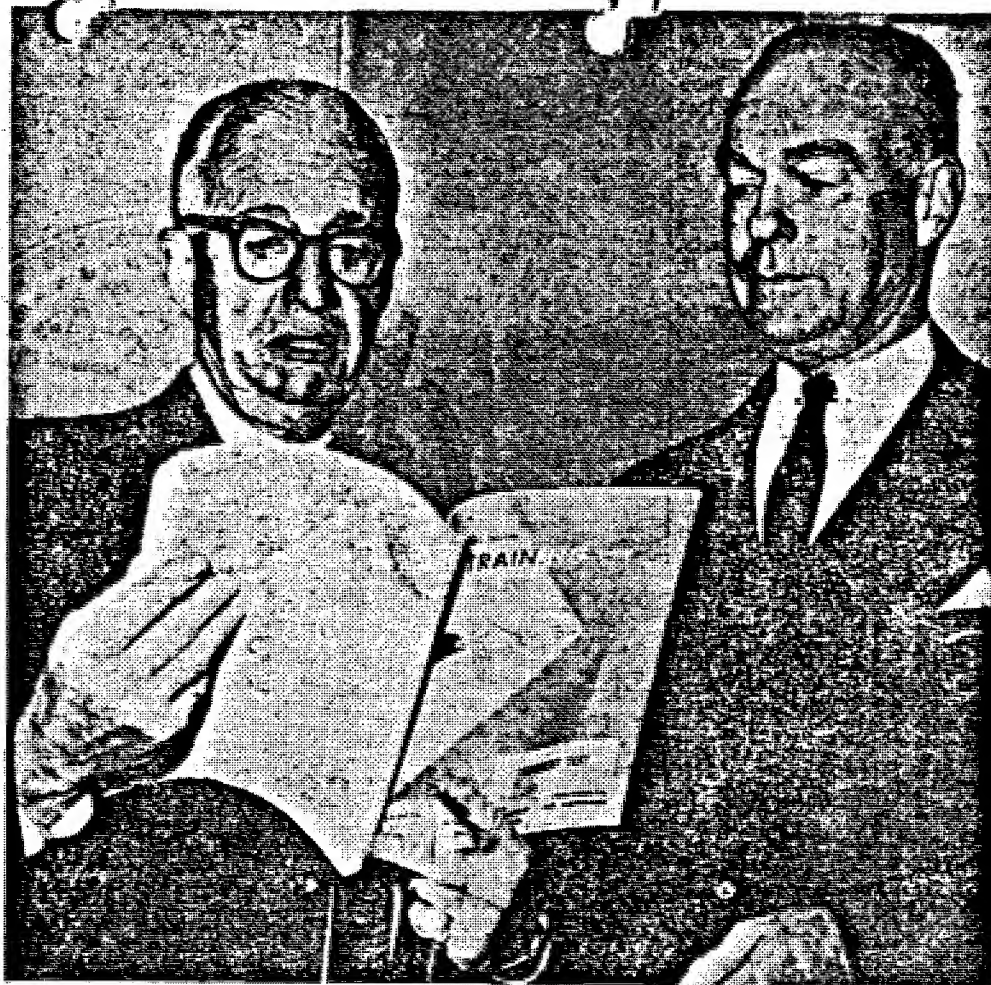
Chairman Walter of the House Un-American Activities Committee (left) and Secretary of the Air Force Dudley C. Sharp look over an Air Force training manual yesterday before a closed door session of the committee.

Two officials of the American Council told Mr. Gates that "there is a place for the