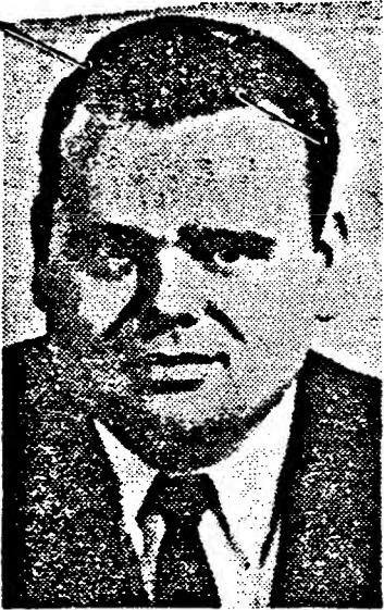
Dr. Billy James Hargis