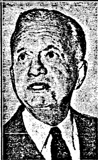
Rep. Francis E. Walter Considers probe into withdrawal

The Air Force ordered immediately a review of all service manuals and directed creation of special boards at all publication points. They will be responsible