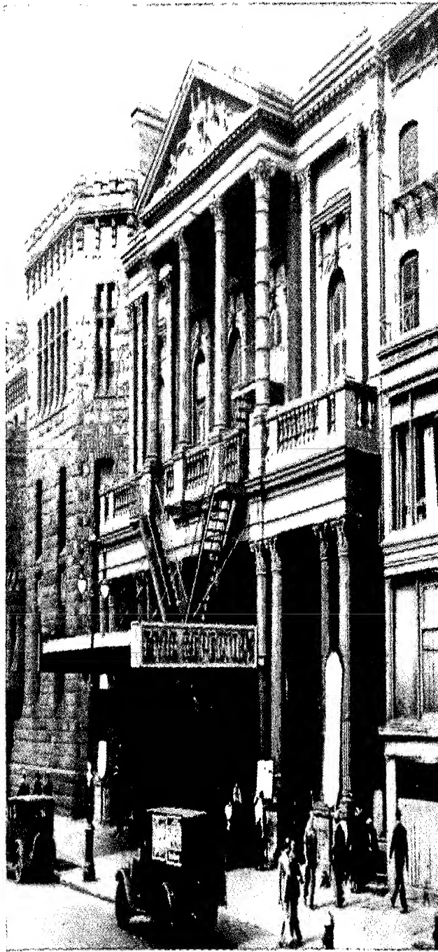
Civic Repertory Theatre on 14th Street, where Edwin Booth and other famous 19th Century actors appeared. Large for its day, there was not a single piece of steel in its construction. We demolished this building to make way for ultimate improvements.