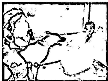
This undated still photo made available by The Washington Post on Friday May 21, 2004,...