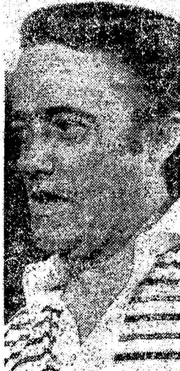
ROBERT VAUGHN "... a fantasy."

"Well," I said, "I looked in the files and found this Evans and Novak column . . ." and then proceeded to quote from the Feb. 13, 1966, column. It said that the embryonic political career of Robert Vaughn had sustained a self-inflicted blow of monumental proportions." Because although as a TV secret agent he delighted audiences with surprise gimmicks, "politicians even more than ordinary people don't like to be surprised," and there was "stunned silence" at a Democratic