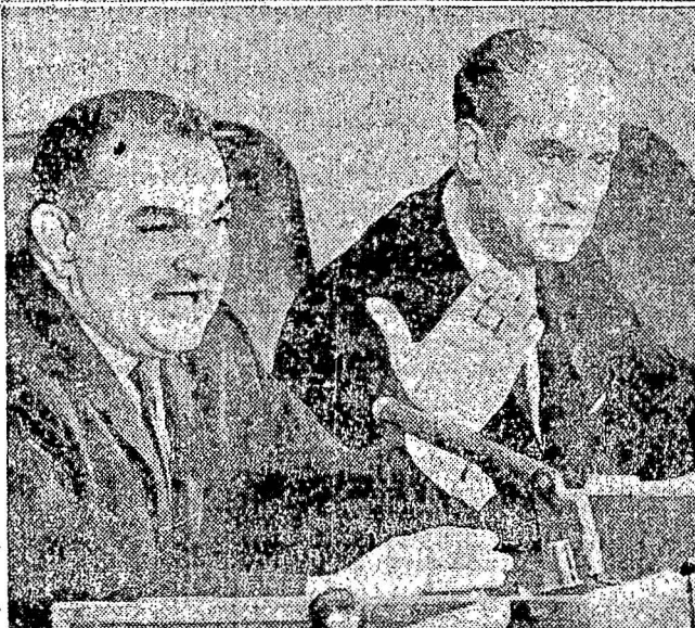
WAR VIEWS —Actor Robert Vaughn, top, speaks at unofficial hearing conducted, below, by Congressmen George Brown Jr., left, Edward R. Roybal, right.