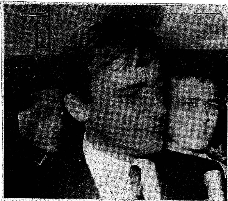
ACTOR ROBERT VAUGHN AT SAN FRANCISCO MOBILIZATION