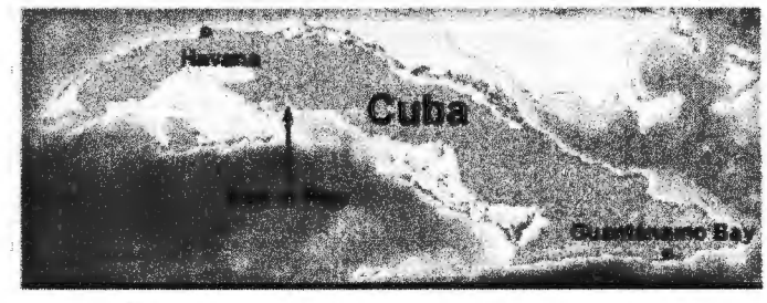
Map of CUba