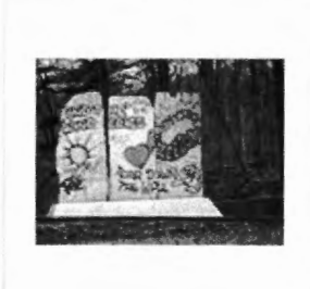
Berlin wall west 020.jpg 2.83 MB