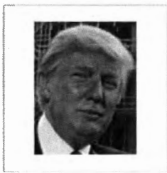
Donald Trump.jpg 4,835 bytes