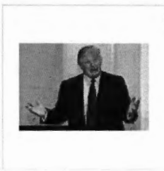
Puerto Rico Trump2.jpg 21,784 bytes