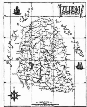
(U) Map of Zendia, drawn by Lambros Callimahos to accompany "The Zendian Problem," a traffic analysis exercise.