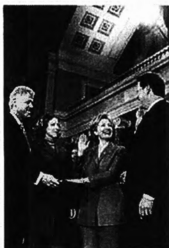
Re-enactment of Hillary Rodham Clinton being sworn in as a United States Senator by Vice President Al Gore in the Old Senate Chamber, as President Clinton and daughter Chelsea look on. January 3, 2001.

Clinton served on five Senate committees: