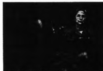
Senator Clinton listens as Chief of Naval Operations Navy Admiral Mike Mullen responds to a question during his 2007 confirmation hearing with the Senate Armed Services Committee.

Clinton opposed the Iraq War troop surge of 2007 and supported a February 2007 non-binding Senate resolution against it, which failed to gain cloture. [20] In March 2007 she voted in favor of a war spending bill that required President Bush to begin withdrawing troops from Iraq within a certain deadline; it passed almost completely along party lines [21] but was subsequently vetoed by President Bush. In May 2007 a compromise war funding bill that removed withdrawal deadlines but tied funding to progress benchmarks for the Iraqi government passed the Senate by a vote of 80-14 and would be signed by Bush; Clinton was one of those who voted against it. [22] Clinton responded to General David Petraeus's September 2007 Report to Congress on the Situation in Iraq by saying, "I think that the reports that you provide to us really require a willing suspension of disbelief." [23] In September 2007 she voted in favor of a Senate resolution calling on the State Department to label the Islamic Revolutionary Guard Corps "a foreign terrorist organization," which passed 76-22. [24]