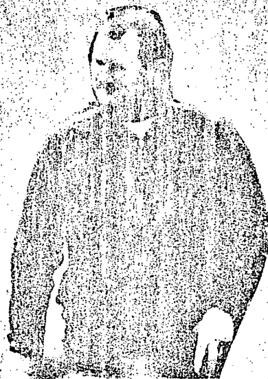
Comm. Exh. 237