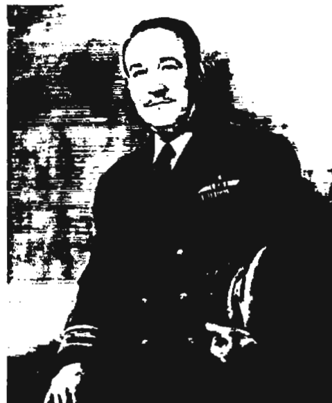
Admiral Sidney W. Souers Executive Secretary, NSC