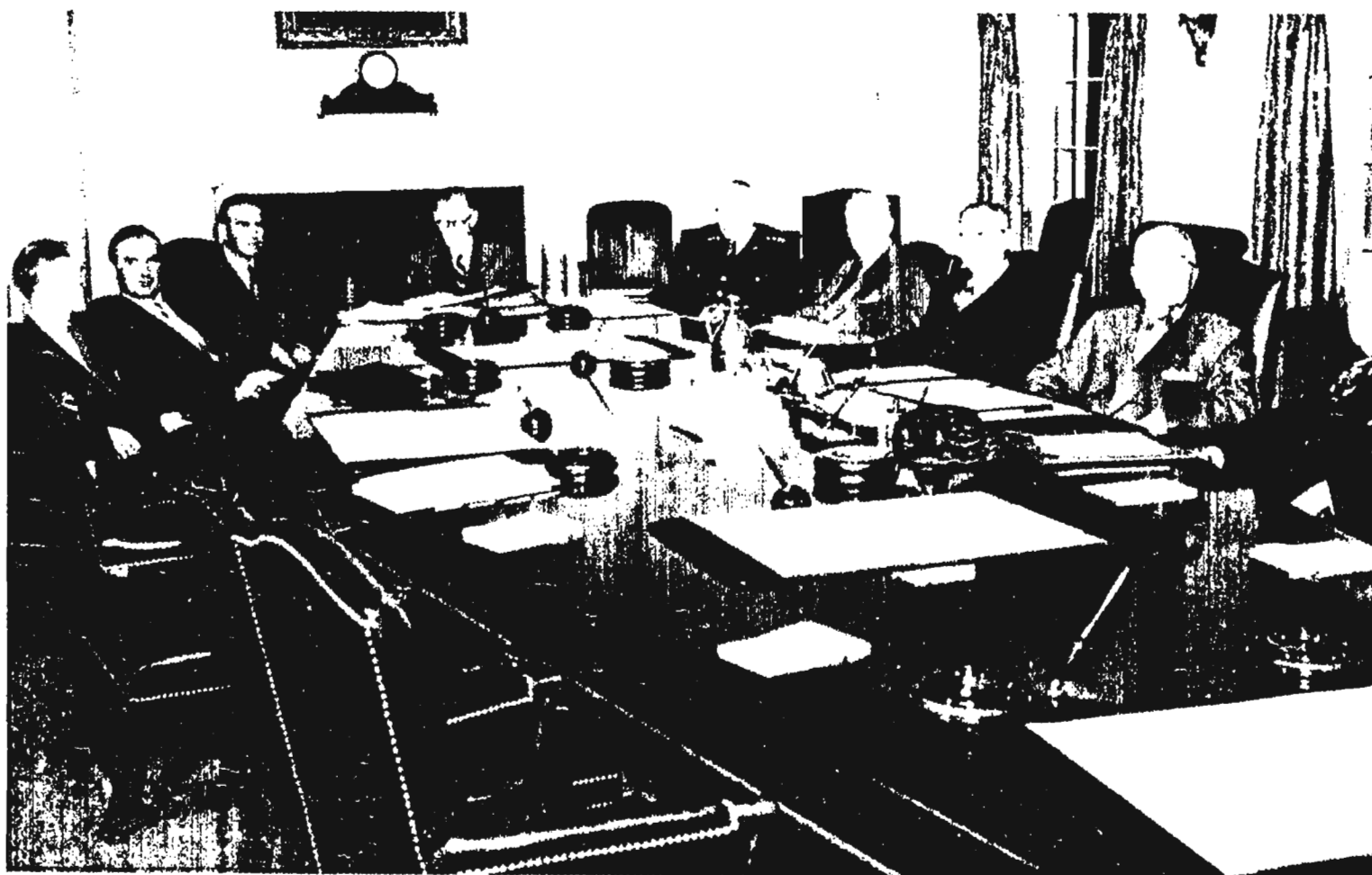
Meeting of the National Security Council, January 1951