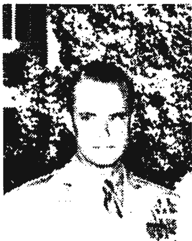
Lieutenant General Hoyt S. Vandenberg STANCIB Chairman

The COMINT organizations would coordinate their activities but would remain totally independent organizations. In addition to the integration of Army-Navy personnel on certain analytic problems, STANCIB divided the Army-Navy responsibility for military and naval targets along the traditional lines and identified the diplomatic and commercial communications as a "joint" responsibility, to be placed under the direction of the new Coordinator of Joint Operations. To implement this new concept of Army and Navy cooperation, STANCIB directed the Chiefs of ASA (Army Security Agency) and OP-20-G to draw up the details of a plan and statements of general principles governing the roles and responsibilities of the services and the Coordinator of Joint Operations. 23