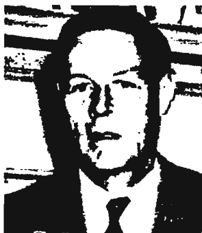
Charles E. ("Chip") Bohlen