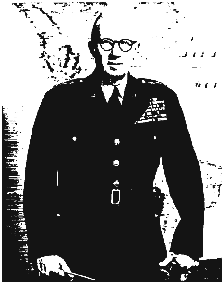
Major General Ralph J. Canine

take issue with some aspects of the report. The committee had proposed an extension of the responsibilities of AFSA to include a communications security responsibility for the entire United States government rather than merely the Department of Defense, as was then the case. Canine agreed in principle with the proposal but pointed out that the committee had included very little on communications security in its report. He recommended that the proposed directive be confined to COMINT, with communications security to be made the subject of another study and to be addressed in a separate directive. Canine also argued strongly against retention of the rule of unanimity – even for COMINT matters outside the jurisdiction of AFSA. He pointed out that this would only serve to perpetuate one of the chief difficulties that had hampered USCIB in the past. He urged the acceptance of a majority-rule principle to govern all USCIB decisions. Lastly, Canine pointed out that the Brownell Report had omitted the generally accepted