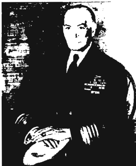
Admiral Roscoe H. Hillenkoetter Director of Central Intelligence