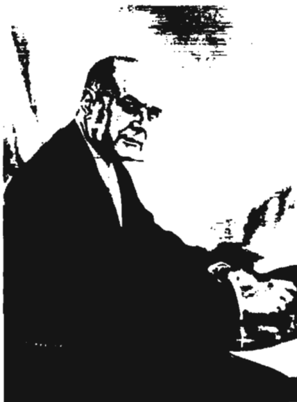
Louis A. Johnson, Secretary of Defense

Over the next three years the Air Force, as an independent service, had a major impact on the Army-Navy COMINT organizations. The establishment of the AFSS indicated that Air Force officials demanded a security service or cryptologic organization equal to the