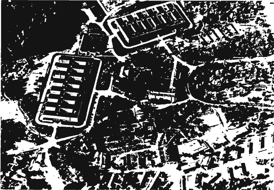
Aerial view of Arlington Hall Station

Coincidental with the negotiations over the allocation of cryptanalytic targets and in anticipation of new and greatly expanded operational missions, each service initiated search actions for the acquisition of new sites to house their already overcrowded facilities. Within one year, the services accomplished major relocations and expansions of their operations facilities within the Washington, D.C., area.