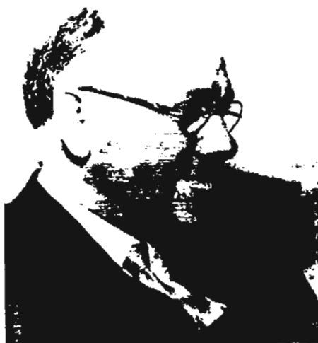
Edward W. Travis Deputy Director, G.C. & C.S.

In exploring the possibility of establishing postwar collaboration with the United Kingdom, many alarming reports emerged about the earlier lack of Army-Navy coordination and the existence of overlapping agreements with the United Kingdom. For example, the Navy noted, "the lack of coordination between the Army and the Navy was strikingly demonstrated by an Army-British agreement which was made during the war without the concurrence of the Navy, even though it directly affected the air material in which the Navy had a vital interest. It also provided for a complete exchange between the Army and the British of all technical material, although the Navy had an agreement to make only a limited exchange with the British." 71 The Navy cited similar problems in some of its COMINT relationships with U.S. consumers. It noted that both services experienced similar difficulties stemming from their unilateral dealings with the FBI and OSS. It was not until the creation of the informal ANCICC that the Army and Navy achieved a united front in dealing with these agencies. 72 By the end of the war, Army and Navy officials came to realize that COMINT agreements with foreign governments or other domestic agencies could no longer be determined on an ad hoc basis by each service.