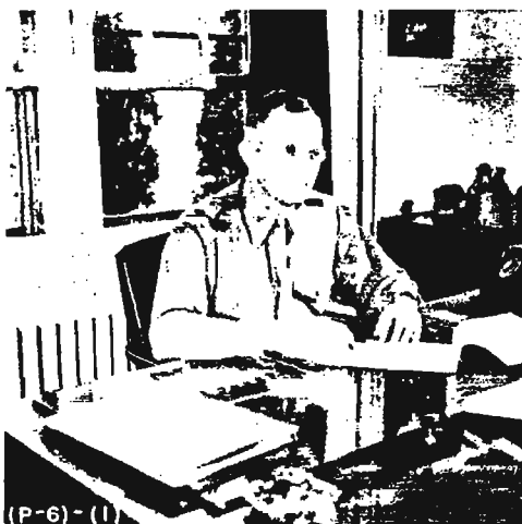
Colonel W. Preston Corderman, USA