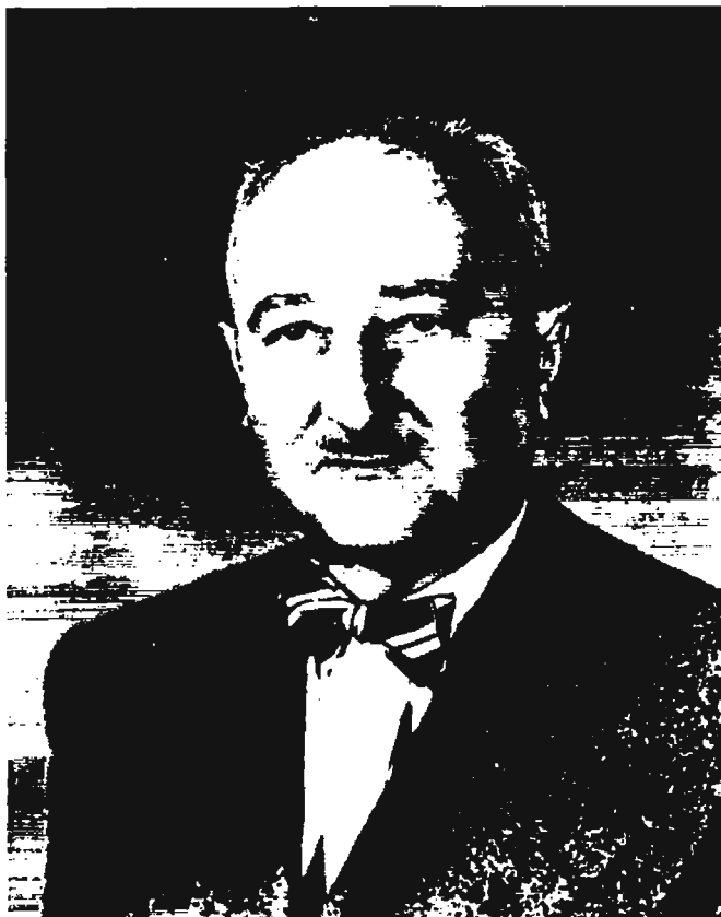
William F. Friedman

The stated fundamental objective of the CONSIDO consolidation plan was to improve Department of Defense intelligence and contribute to "efficiency and economy." With the establishment of CONSIDO, the COMINT exploitation units of all other departments were to be abolished. CONSIDO was to provide integrated intelligence estimates on all available COMINT and was to reflect the joint view of all intelligence agencies. 4 General Joseph T. McNarney, special assistant to the Secretary of Defense, became an enthusiastic supporter