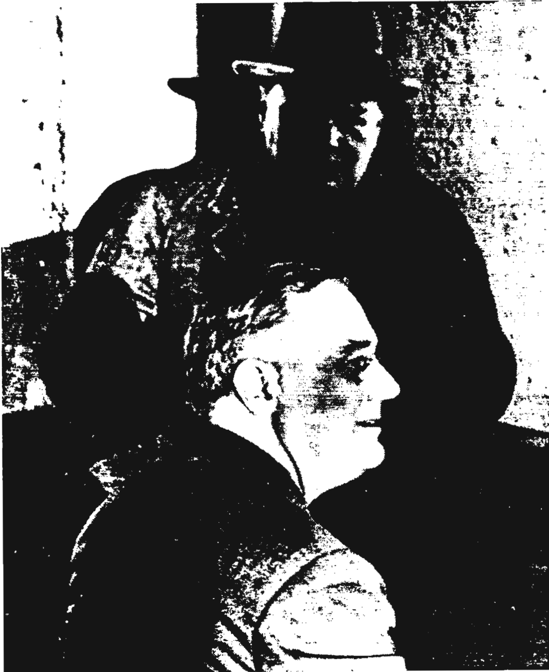
Franklin D. Roosevelt and Winston Churchill established a direct channel of personal communications in 1940, reinforcing strong ties between the United States and Great Britain.