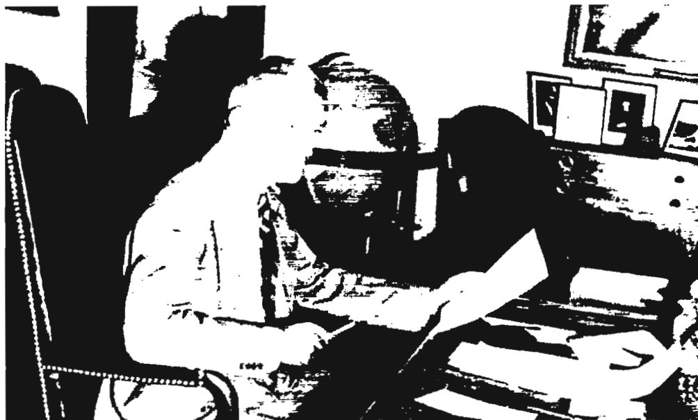
James V. Forrestal, First Secretary of Defense, 1947-1949