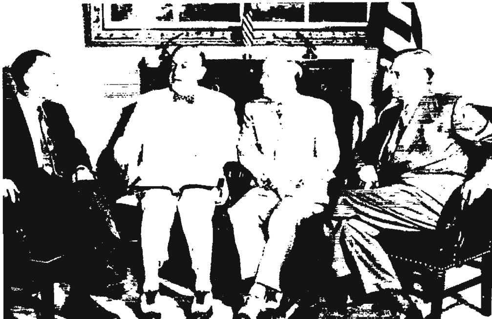
The Johnson Team

Thus, the atmosphere for cooperation and consolidation was volatile. However, by the time the vote on the AFSA merger took place, Johnson had appointed a new Secretary of the Navy, Francis P. Matthews, whom he had selected personally. 29 Matthews supported Johnson's position. As for the Air Force, Vandenberg, as Air Force Chief of Staff, had consistently and actively promoted the growth of the Air Force as an independent service. In addition to the commitment for an independent cryptologic arm for the Air Force, it is also likely that Vandenberg envisaged receiving greater financial support for aircraft programs if he went along with consolidation in other areas such as the merger of cryptologic activities.