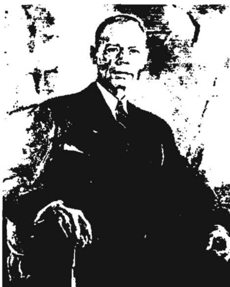
General Walter Bedell Smith, DCI