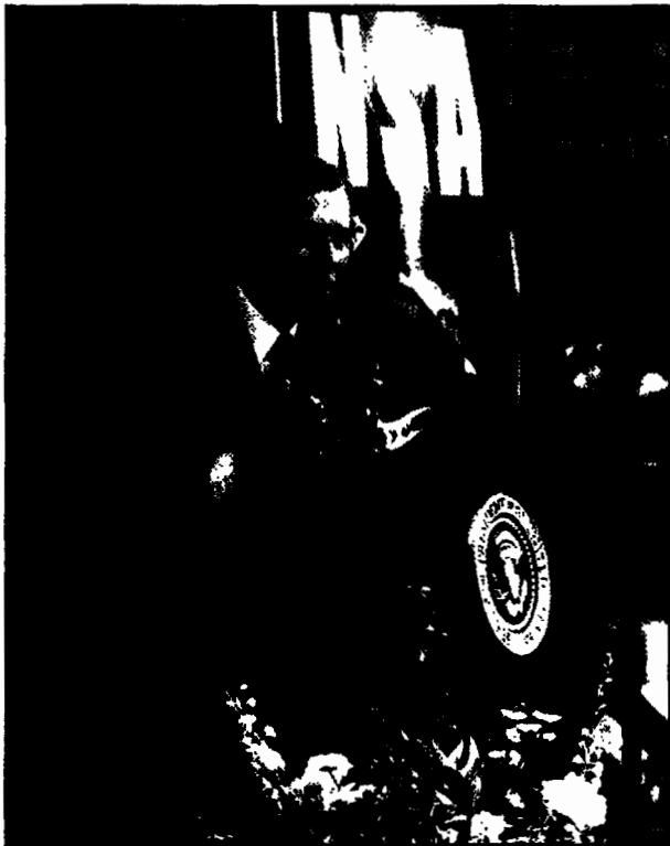
President George W. Bush at NSA, June 2002

(S//SI//REL) Over a year later, on June 4, 2002, President Bush himself visited NSA, the third to do so.* The president visited the National Security Operations Center, inspected gear used in Afghanistan and nuclear code material, and got a briefing from the Office of Counterterrorism.