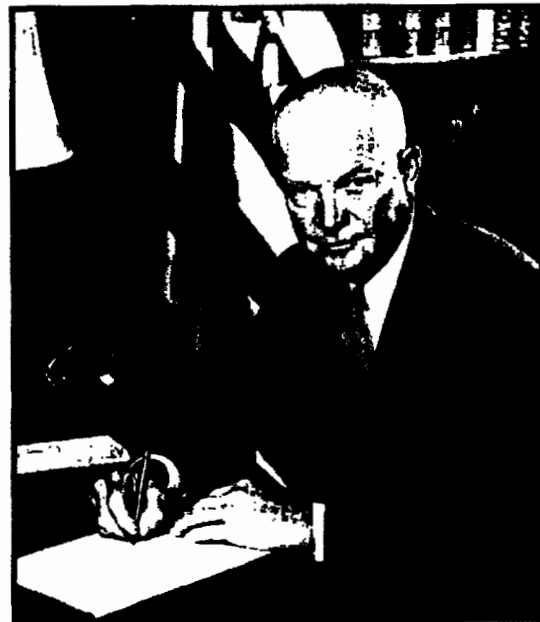
President Dwight D. Eisenhower

(U) Second, once election results have been tabulated, the CIA has delivered intelligence briefings to the president- and vice president-elect and other senior officials through the President's Daily Brief (PDB), which contains the latest all-source information – often about sixty percent of it from signals intelligence. Tailored briefings have reflected the personal interest of