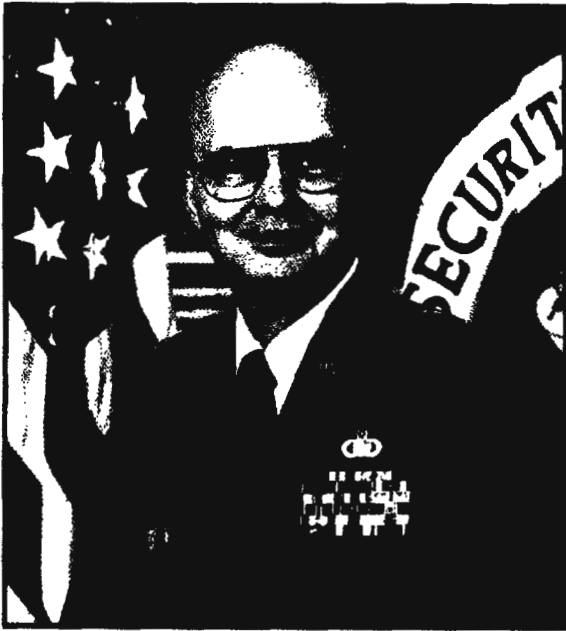
Lieutenant General Michael Hayden

(U) Immediately, however, he commissioned two studies, by inside and outside experts, to address the most serious shortcomings at NSA. Based on these two reports, General Hayden began far-ranging changes to NSA's structure and personnel on November 16, 1999. The first period in this process was entitled "the hundred days of change," although institutional reordering continued for months afterward in many areas.