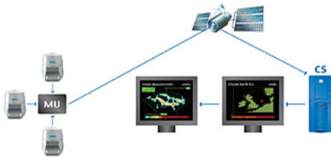
OSIS system structure, showing shows three Sensor Packs, the Master Unit (MU) and Central Server (CS)

OSIS differentiates two system configurations: a comprehensive system including complete sensor pack, transmission system and presentation software as well as additional sensor pack's enabling expansion of the surveillance area within reach of a satellite link already established.